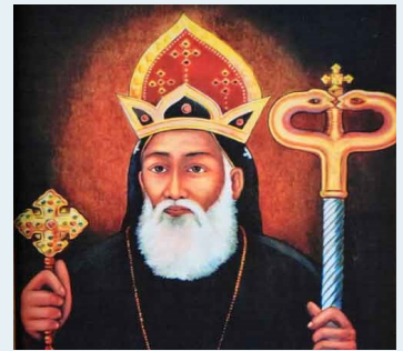
Mar Thoma II (1670-1686)

Mar Thoma II was the second Metropolitan of the Malankara Syrian Church from 1670 to 1686. By the time of Mar Thoma II became the Metropolitan of Malankara in 1670, many of the Syriac practices were already reintroduced into Malankara Church. The use of western calendar, baptismal fonts and having pulpits are some of them. During his time priests were encouraged to marry. He preserved the faith and gave leadership to its activities.